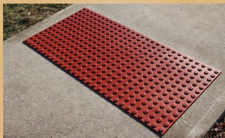
1. Place mat on surface in desired final position, and mask outside edge. (If required cut mat to match ramp geometry.*)