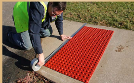
2. Mask outside edge.