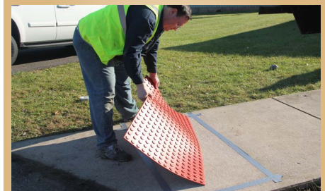
3. Remove mat.