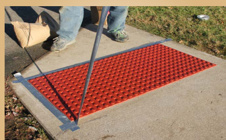
7. Clean off excessive adhesive and remove marking.