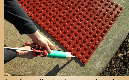
8. After adhesive has cured apply silicone caulking to seal mat edges.

*NOTE: When installing multiple mats leave a 1/8” expansion gap between mats.