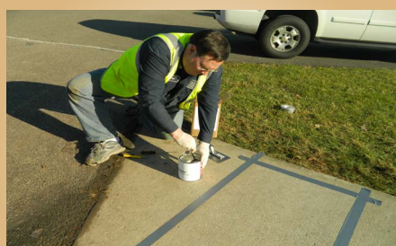
4. Mix adhesive supplied in pre-proportioned containers (1-2 min).