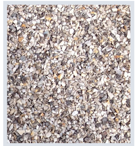
E-Bond 526/526-S materials are ideally suited for either hand-mixing or pumping operations.